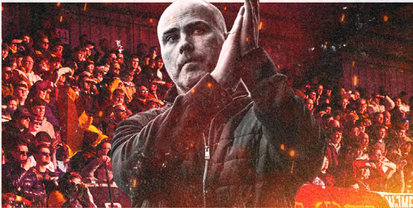
A MESSAGE FROM THE MANAGER